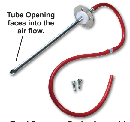
Total Pressure Probe Assembly