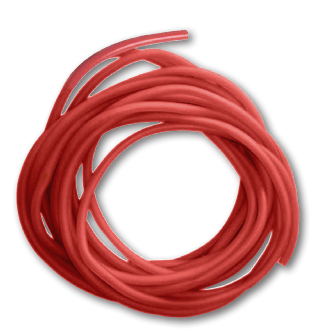
Silicone Rubber Tubing

ZPS-SIL-250-125-50 ............ 50 foot roll of silicone rubber tubing