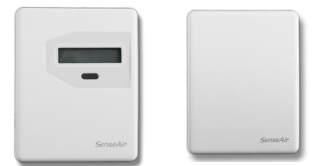
eSENSE™ Disp eSENSE™ Dim: 100 x 80 x 28 mm