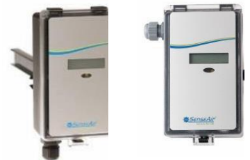
eSENSE™ Duct Disp eSENSE™ Ind Disp Dim: 142 x 84 x 46 mm