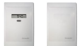
eSENSE™ II Disp eSENSE™ II Dim: 130 x 85 x 30 mm