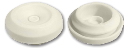
Top and bottom view of a Pierceable Knockout Plug

Pierceable Knockout Plugs are available for the open port in the BAPI-Box Crossover and BAPI-Box 4 Enclosure, as well as the non-threaded ports in the BAPI-Box, BAPI-Box 2 and Junction Box and enclosures. The plugs will also work in panels with a metal thickness of 0.118" or smaller.