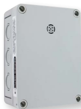
Wall Mount Without LCD