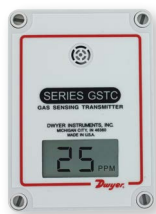
Wall Mount With LCD

High Accuracy Electrochemical Sensor, Universal Output or BACnet &amp; Modbus® Communication Protocol Options