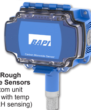
CO Rough Service Sensors (Bottom unit shown with temp and %RH sensing)