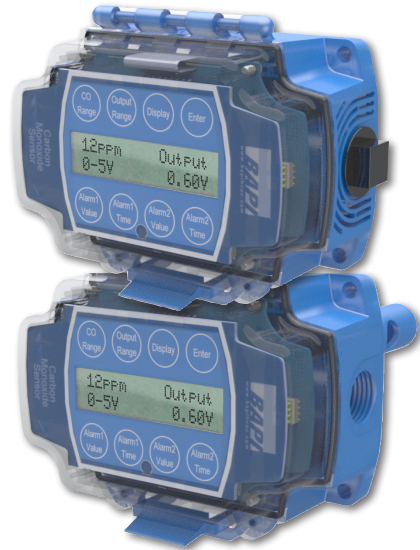
Rough Service (top) and Duct CO Sensors

The field replaceable sensor element lasts approximately 7 years and is self tested daily.