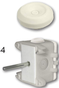
BAPI-Box 4 Duct Sensor with Plug Installed

A Pierceable Knockout Plug is available for the open hole in the BAPI-Box 4 enclosure (and for ports in other enclosures). With the plug installed, the BAPI-Box 4 carries an IP44 rating. See "Accessories" for more info.